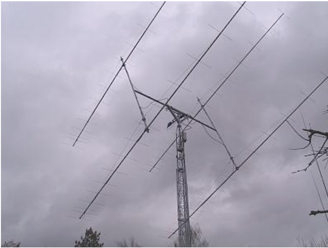
EME Antenna (4 x 16el 10JXX)